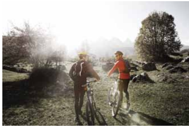
Our mission: We support our customers to face their future with confidence.

At Swiss Life, we serve our clients with our know-how built on long-standing experience and financial solidity. We strive to be your trusted partner, staying engaged and open in all our solutions for you – from day one and all your tomorrows. We know our clients; we understand your needs and empower you to make the right selection from a wide range of flexible solutions. We are passionate about helping you achieve peace of mind. This is the basis of our lifelong relationship-building with you.